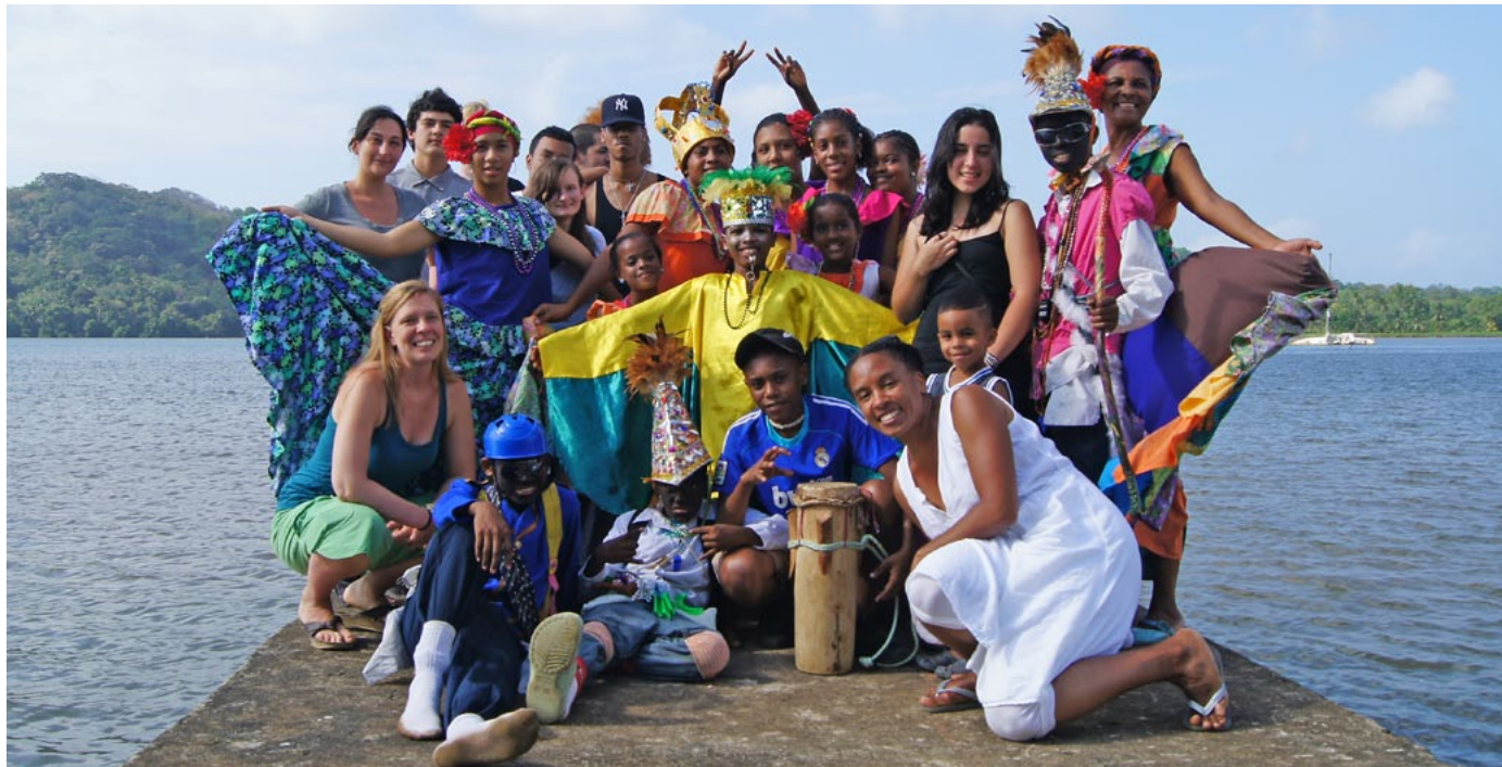
The group with kids from Portobelo's Escuela del Ritmo.

During the week of Winter Break, February 18th through the 27th, ten students and three staff members set off for an action-packed adventure in Panama. After a session spent learning about the geography, history and culture of the country, the group was well prepared when they arrived at Hotel Andino, in the