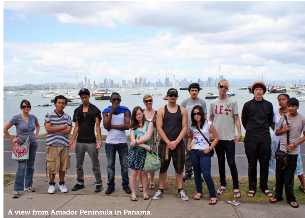
A view from Amador Peninsula in Panama.